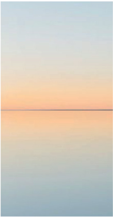
Horizontality as a Guiding Principle