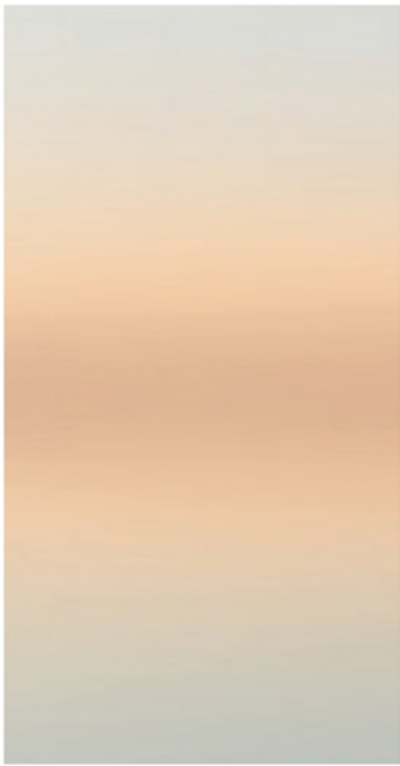
The Evanescent as a Contrasting Element