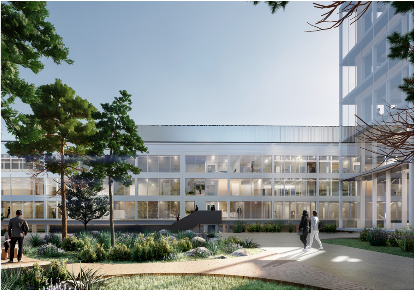
Outside view - P16