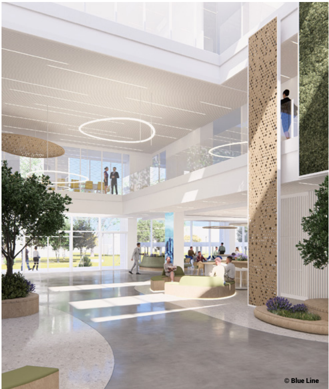
Hall - P17