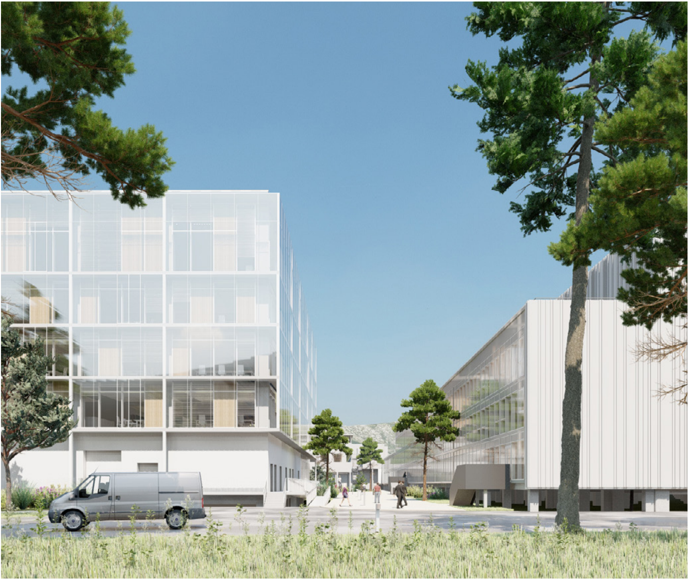
P16 and P17