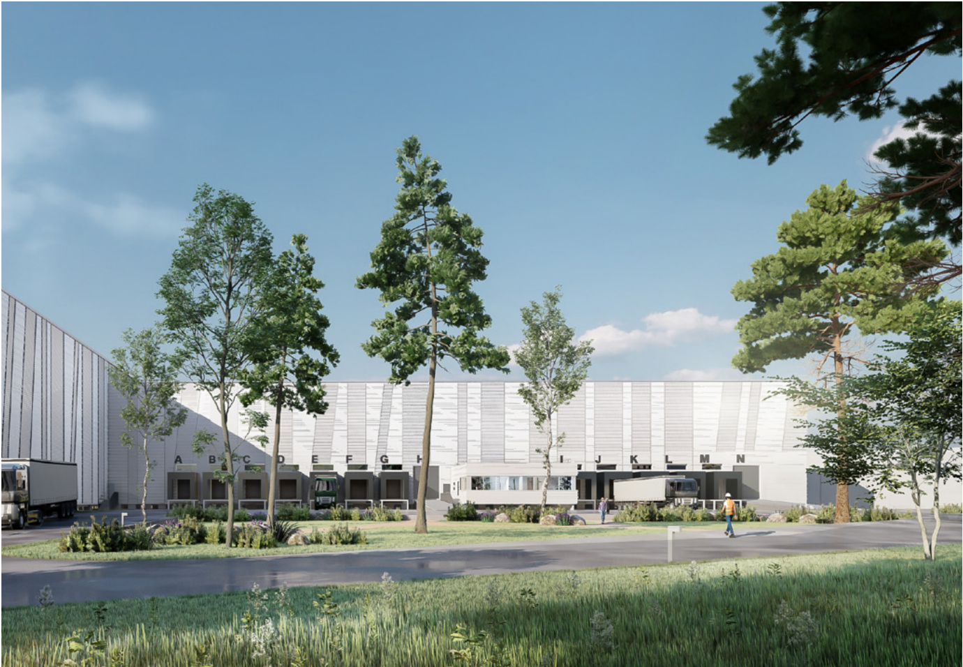
Docks - P16